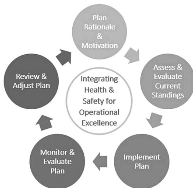
FIGURE 3. Five-point roadmap for Integrating Health and Safety to achieve operational excellence.

The second phase of a roadmap to integration is assessment—that is, achieving a better understanding of an organization’s current status in terms of health and safety and identifying metrics to evaluate its programs